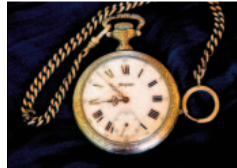
Wednesday, April 1st 10:00 AM

Watch battery replacement services on Wednesday, April 1st, with Dan, our visiting specialist. Residents may drop off their watch(es) in a Ziploc bag at the front desk before 10:00 AM. Please be sure to include payment in the bag, as each battery replacement is $11. All completed items will be available for pickup at the front desk after 5:00 PM the same day. We hope you take advantage of this convenient service!