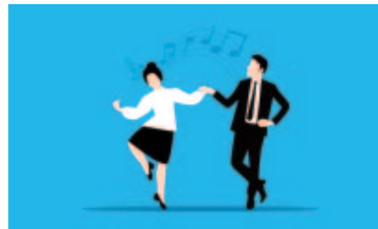
Wednesdays at 1:00 PM starting April 15th