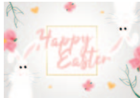
Sunday, April 5th 11:30 AM

Please join us on Sunday, April 5th for a festive Easter Buffet lunch, specially prepared for everyone to enjoy. Enjoy great food and good company as we celebrate the holiday together. Following the meal, continue the fun with an Easter egg hunt in The Opal Lounge, the front desk area, and the Sefton Patio. Keep an eye out for hidden surprises and treats throughout these areas!