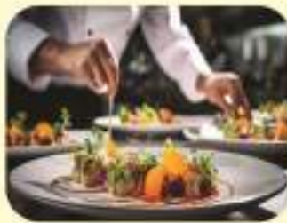
FOOD & WINE PAIRING